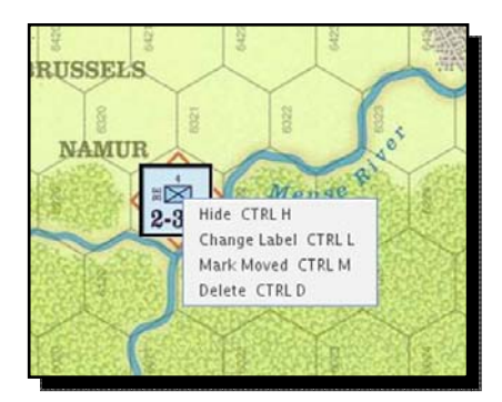
Figure 8: A sample command menu, showing 4 commands and associated hotkeys

Use of the command menu will vary from module to module. In some modules, all piece control, even movement, is performed by right-clicking and choosing a command. In some, the right-click menu is more modest and contains only a few simple commands, such as to clone or delete the piece.