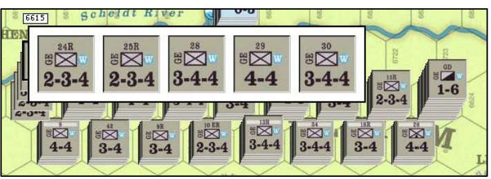
Figure 9: The stack viewer, displaying the contents of a stack of pieces

To unstack pieces, double-click on a stack and the